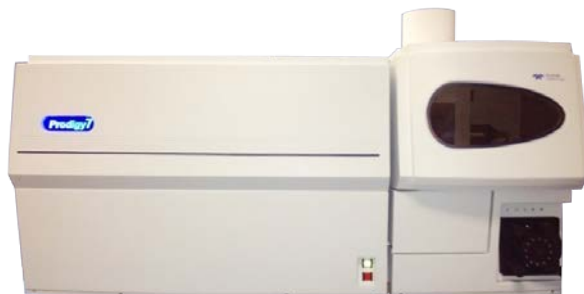
Figure 1: Prodigy7 ICP-OES

In the Safe Drinking Water Act, the EPA outlines National Primary Drinking Water Regulations (NPDWR), which specifies the Maximum Contaminant Levels (MCLs) for drinking water contaminants that are known for causing adverse health effects in people. Contaminants that are known to affect the properties of water (color, taste, smell, etc.) are regulated under the National Secondary Drinking Water Regulations (NSDWR). A third set of contaminants, which fall under the Unregulated Contaminant Monitoring Rule 3 (UCMR-3), must be measured and recorded. The Maximum Contaminant Level (MCL) and Maximum Reporting Limit (MRL) for each contaminant are listed in Table I below.