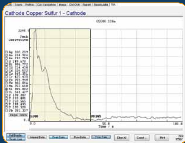
TRA Scan of Ni in High Purity Cu

Time Resolved Analysis (TRA) mode allows the detector to measure wavelength intensities as a function of time and is an extremely useful tool during the method development phase of any DC Arc analysis. During an arc burn, elemental impurities in copper volatilize at varying rates and emit their characteristic wavelengths of light at different times during the arc burn. These emission profiles are captured during TRA analysis and allow the user to quickly and easily set appropriate integration periods (time gates) that maximize the signal to noise ratio for each analyte of interest.