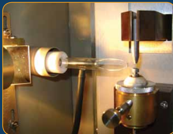
Close-up View of Purged Optical Path Tube

A purged optical path (POP) tube purges the air path from the arc to the optical entrance window of the spectrometer for the measurement of wavelengths in the low UV that would otherwise be absorbed. The gas flowing through the POP tube causes minimal disturbance to the arc and does not degrade analytical precision or sensitivity.