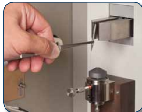
Prodigy DC Arc Stand

The Prodigy contains an arc stand that incorporates a v-grooved "jaw style" counter electrode holder that accommodates counter electrodes of varying outside diameter and length. The sample electrode holder can accommodate any electrode, including mushroom-style electrodes, and contains both a built-in Stallwood Jet and a stopgap to set the height of the sample electrode in a reproducible fashion. The features in both electrode holders facilitate rapid electrode changes between sample burns.